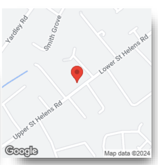
Please note the marker reflects the postcode not the actual property