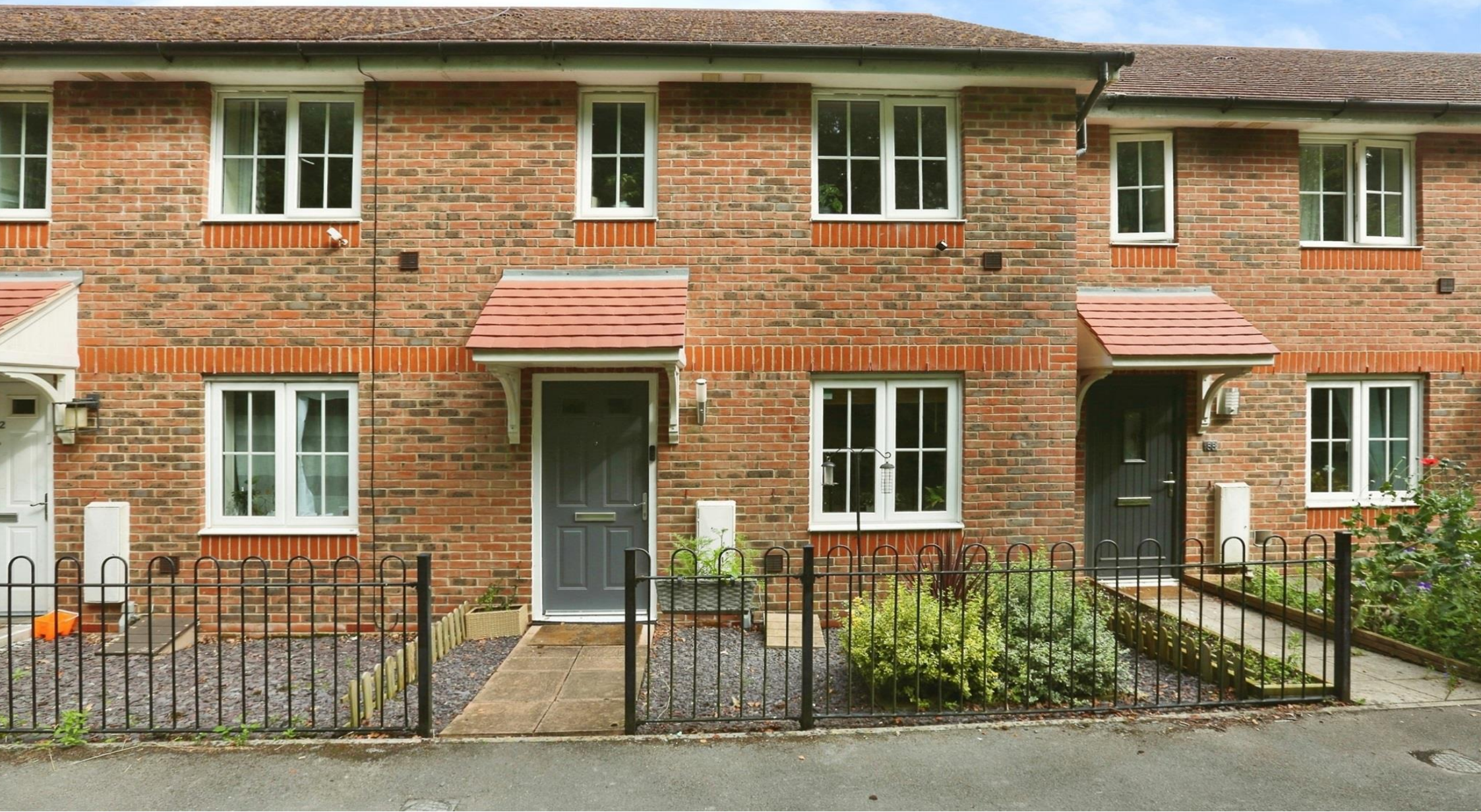
Mescott Meadows, Hedge End Southampton, SO30 2JU