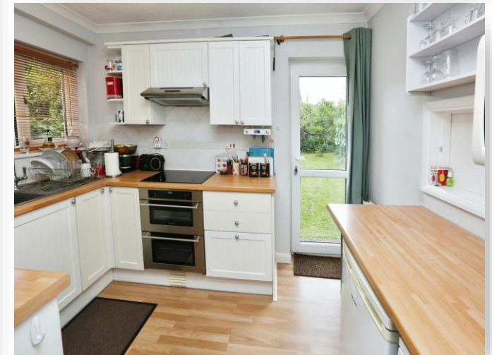
Sovereign Drive, Botley Southampton, SO30 2SR