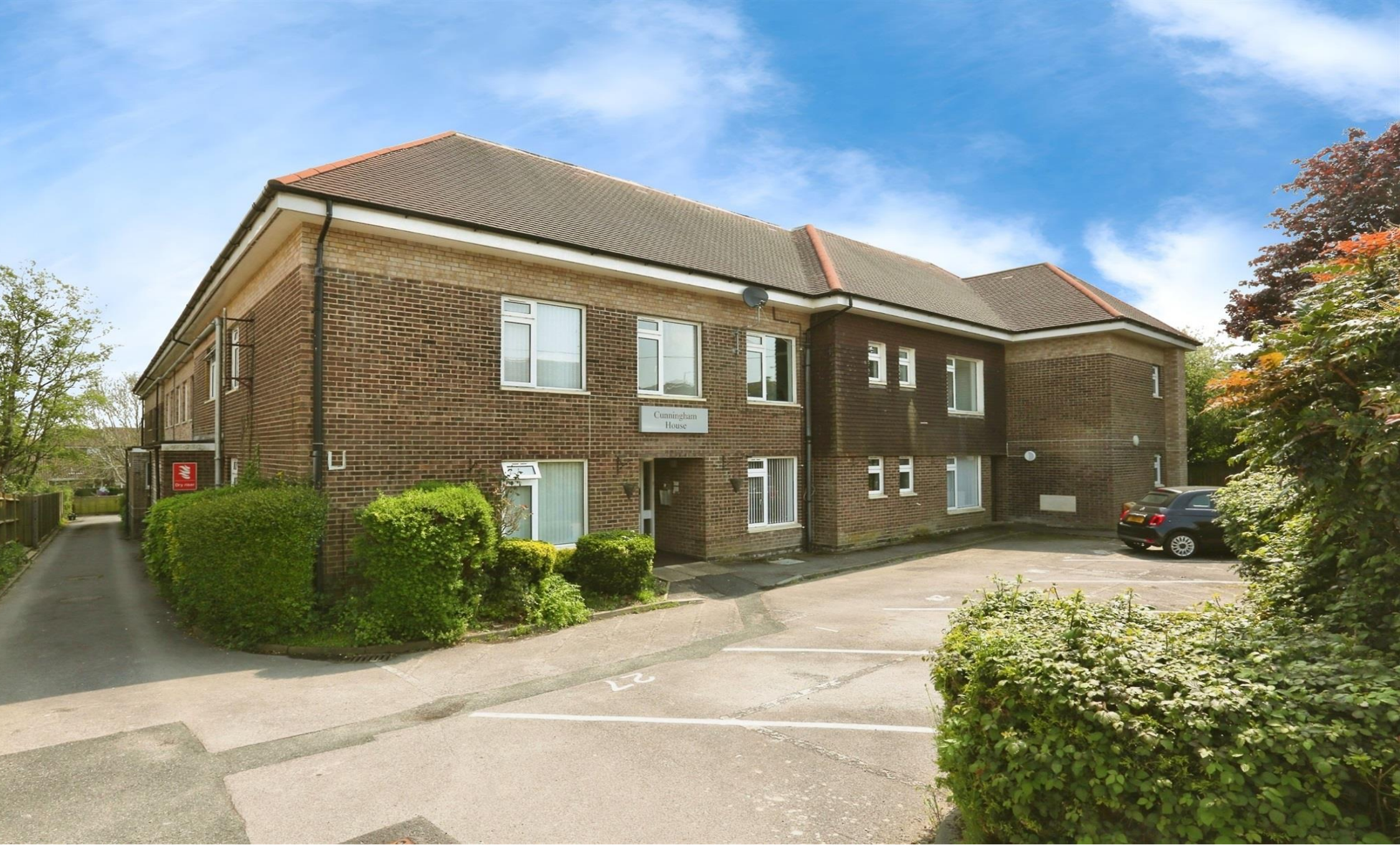
Cunningham House, Claylands Road, Bishops Waltham, Southampton, SO32 1DE