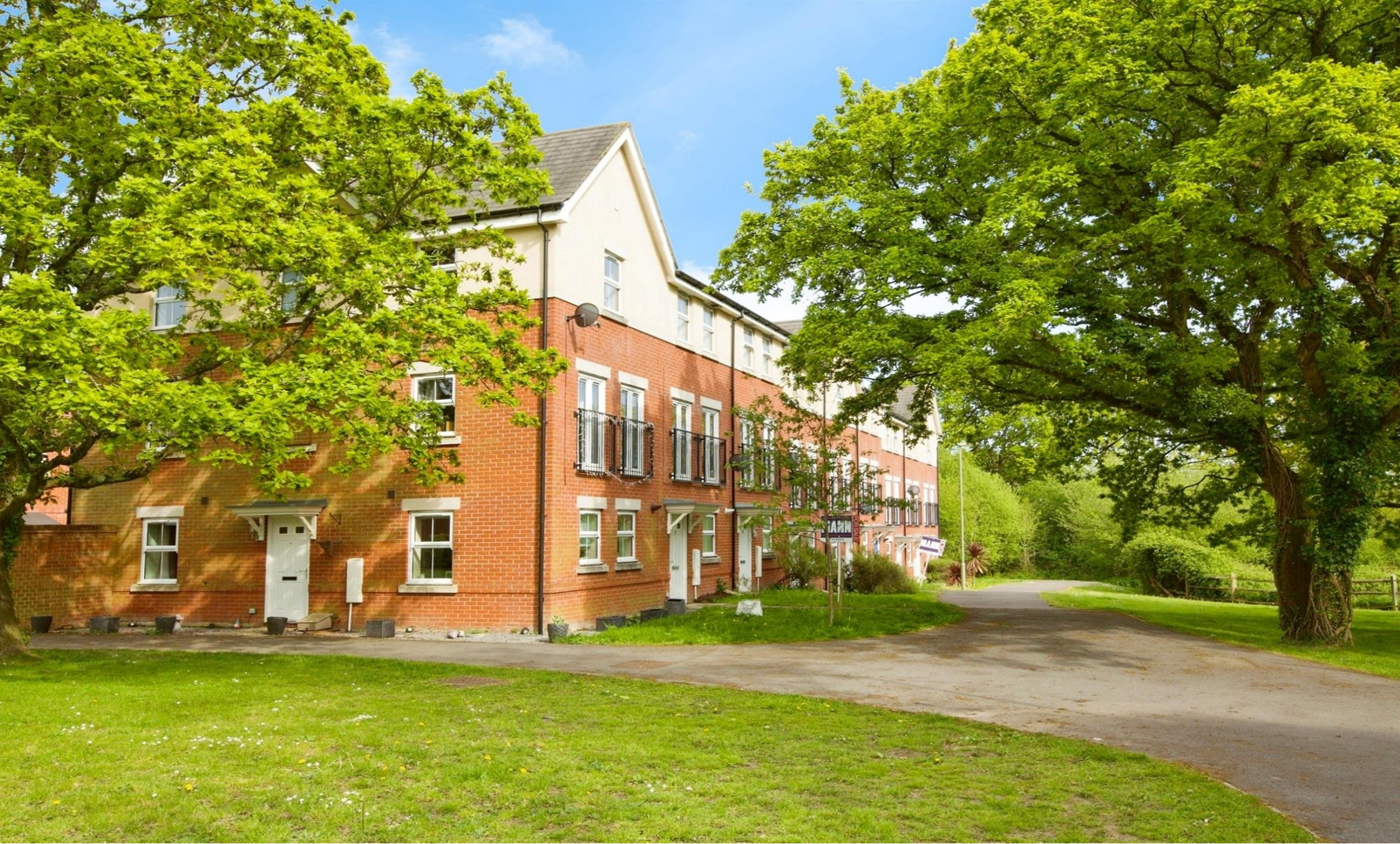
Pandora Close, Locks Heath, Southampton, SO31 6BS