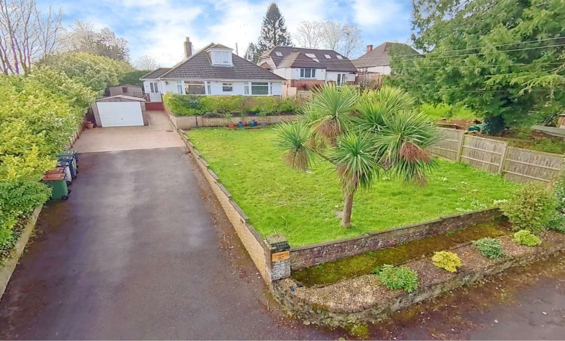
St. Johns Road, Hedge End, Southampton, SO30 4DG