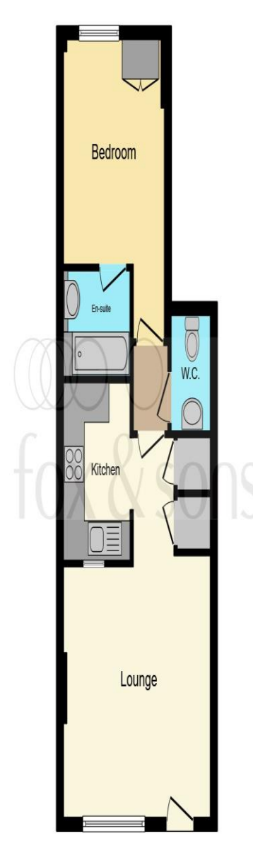
Total floor area 44.7 sq.m. (481 sq.ft.) approx

This floorplan is for illustrative purposes only and is not drawn to scale. Measurements, floor-areas, openings and orientations are approximate. They should not be relied upon for any purpose and do not form any part of an agreement. No liability is taken for any error or mis-statement. All parties must rely on their own inspections.