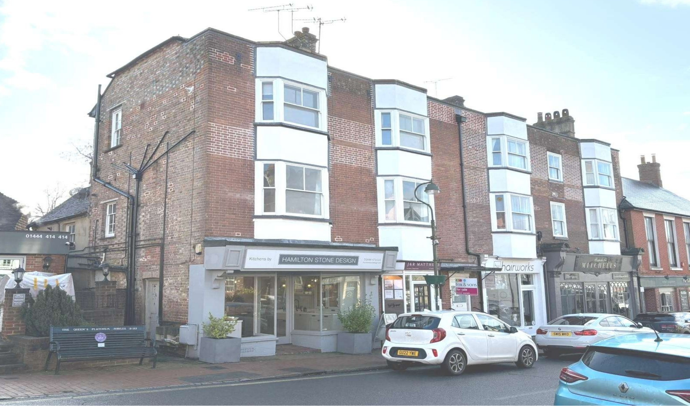
High Street, Cuckfield, Haywards Heath RH17 5JX