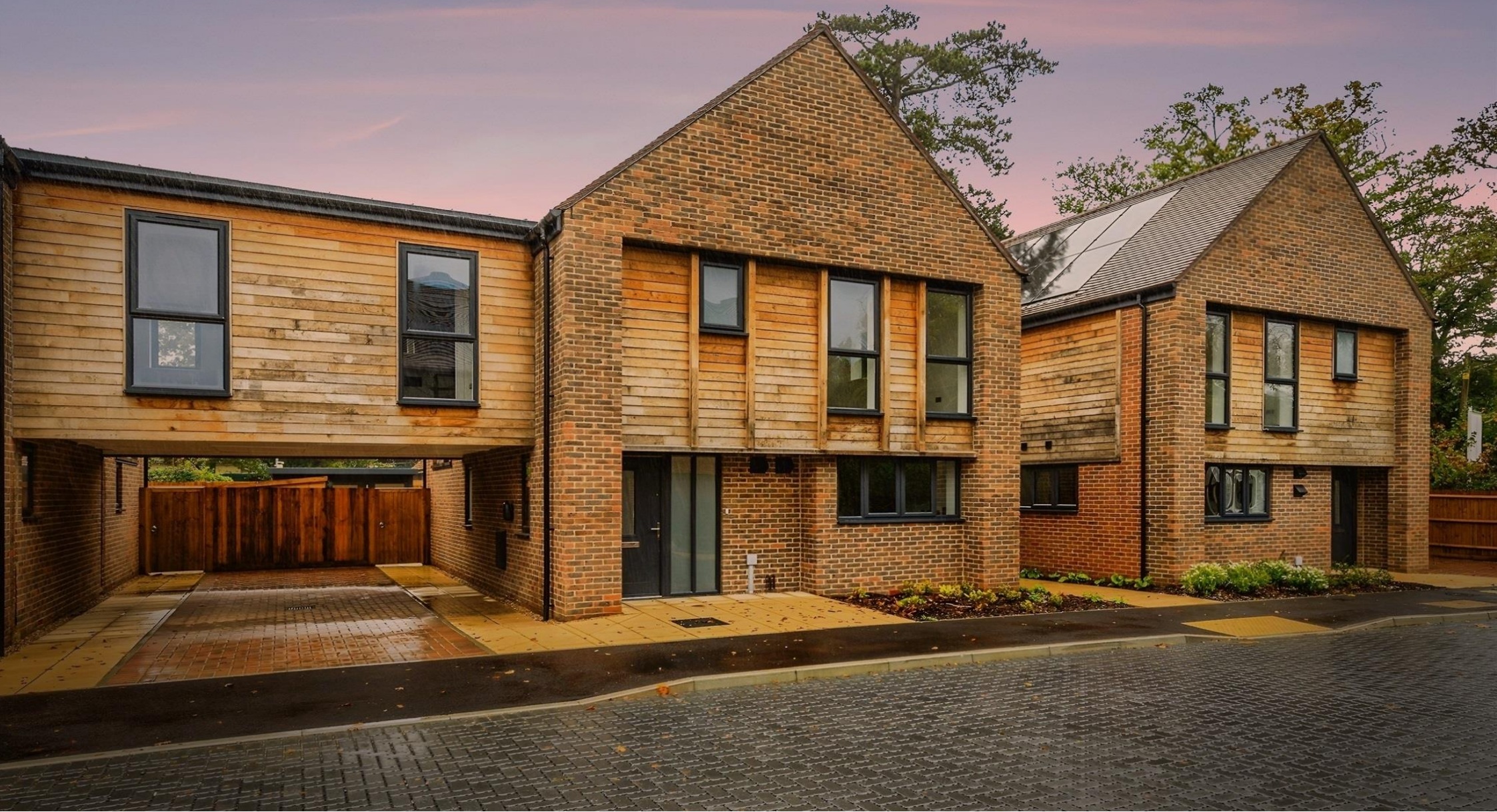
Hanlye View Hanlye Lane,Cuckfield Haywards Heath RH17 5HN