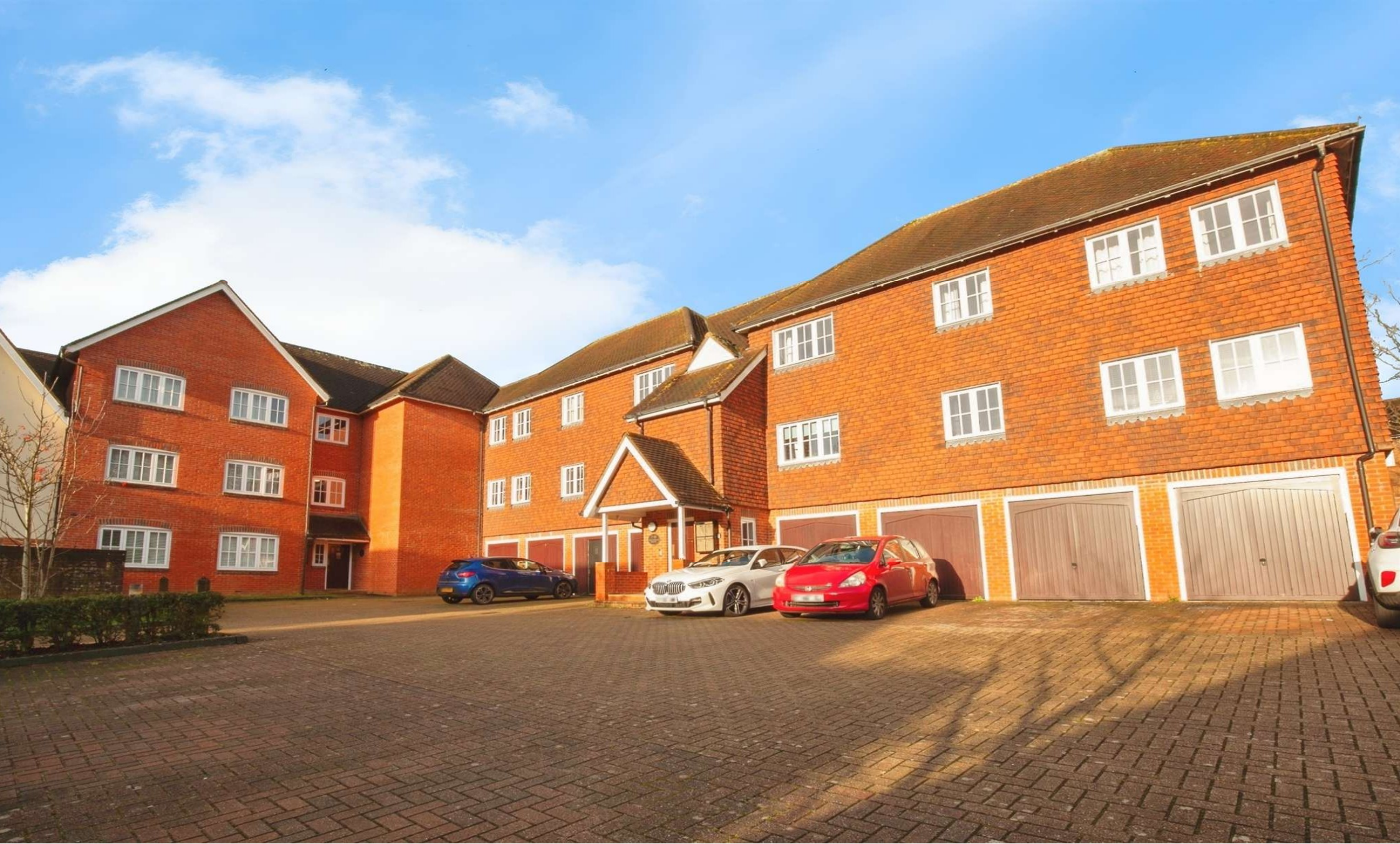
Whitebeam Court, Haywards Heath RH16 4GX