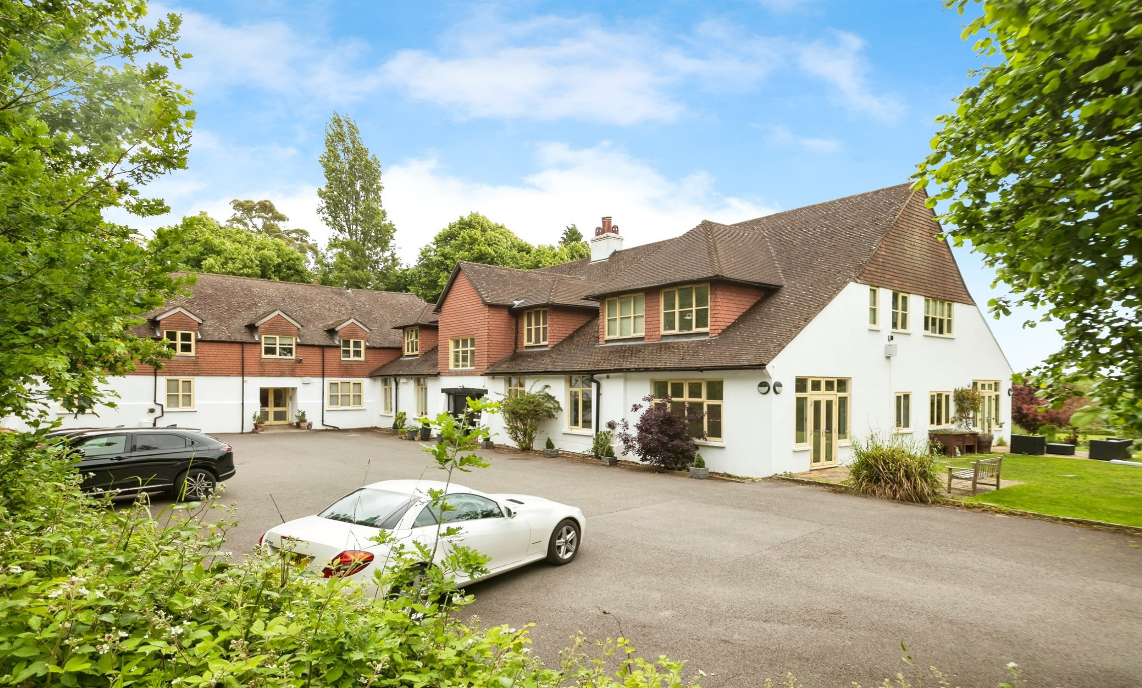
Staplefield Court, Brantridge Lane, Staplefield, HAYWARDS HEATH RH17 6EN