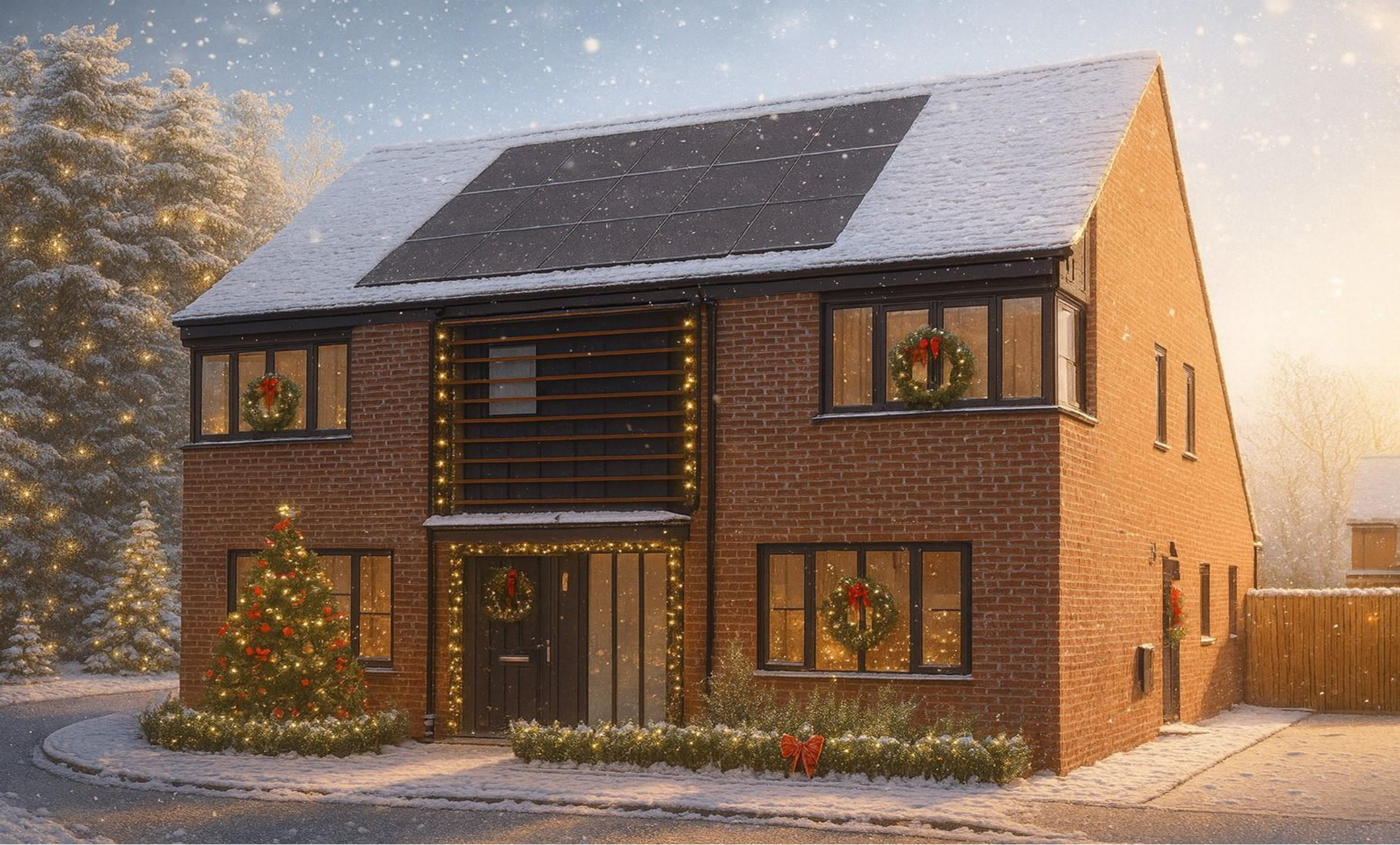
Hanlye View Hanlye Lane, Cuckfield Haywards Heath RH17 5HN