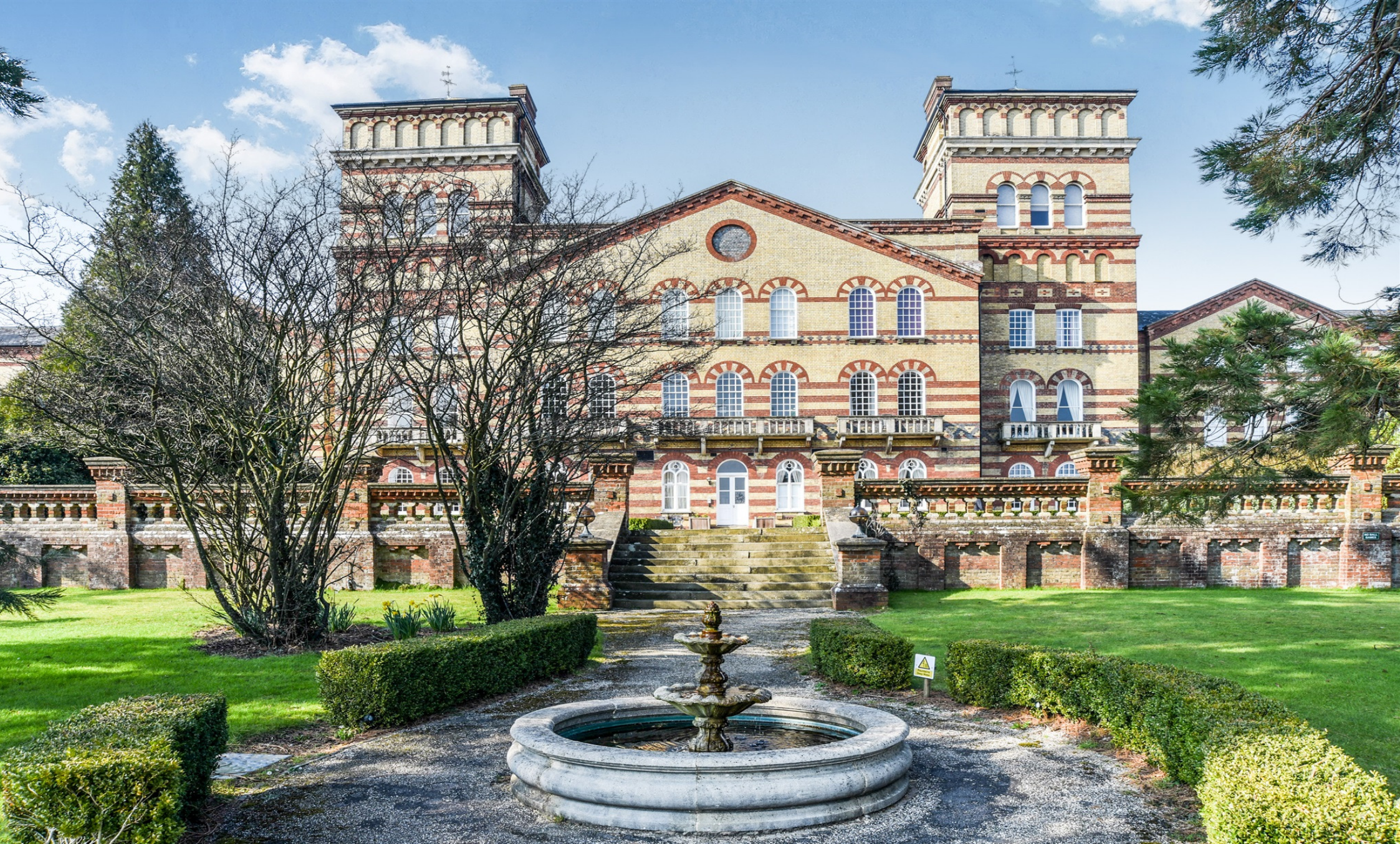
Cavendish House, Southdowns Park, Haywards Heath RH16 4SL