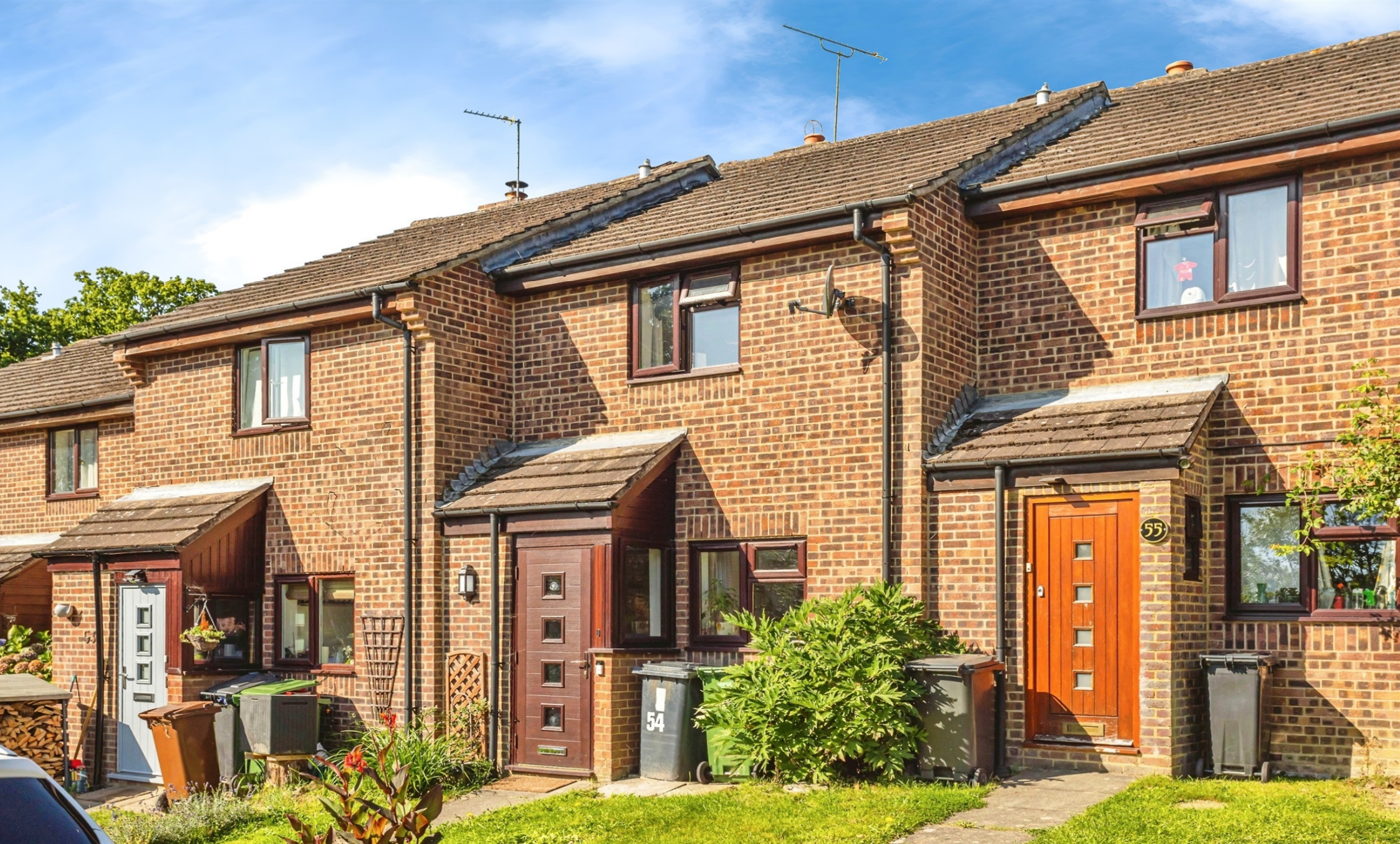
Oak Tree Cottages, Danehill, Haywards Heath RH17 7HY