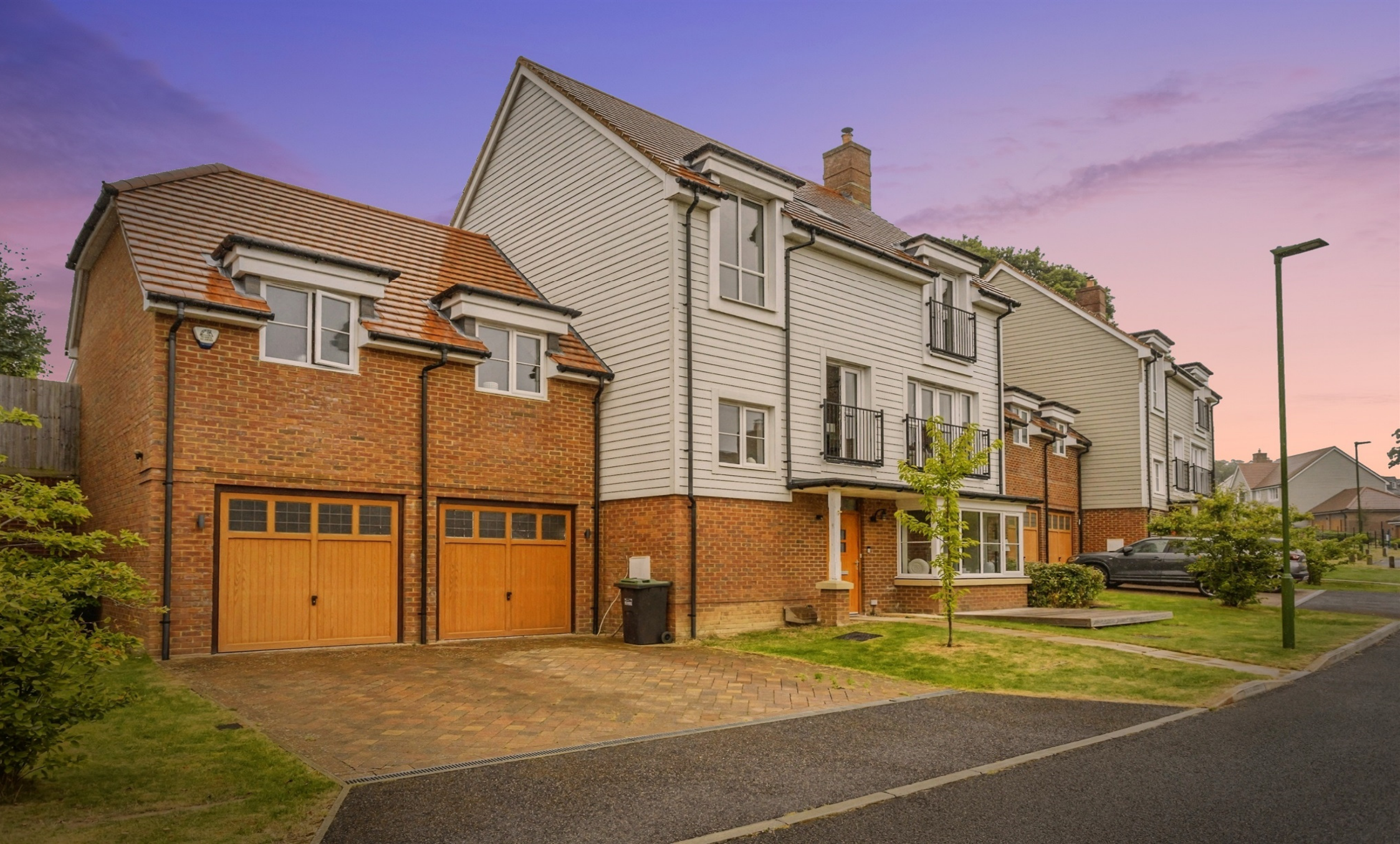
Southern View, Haywards Heath RH16 4XD