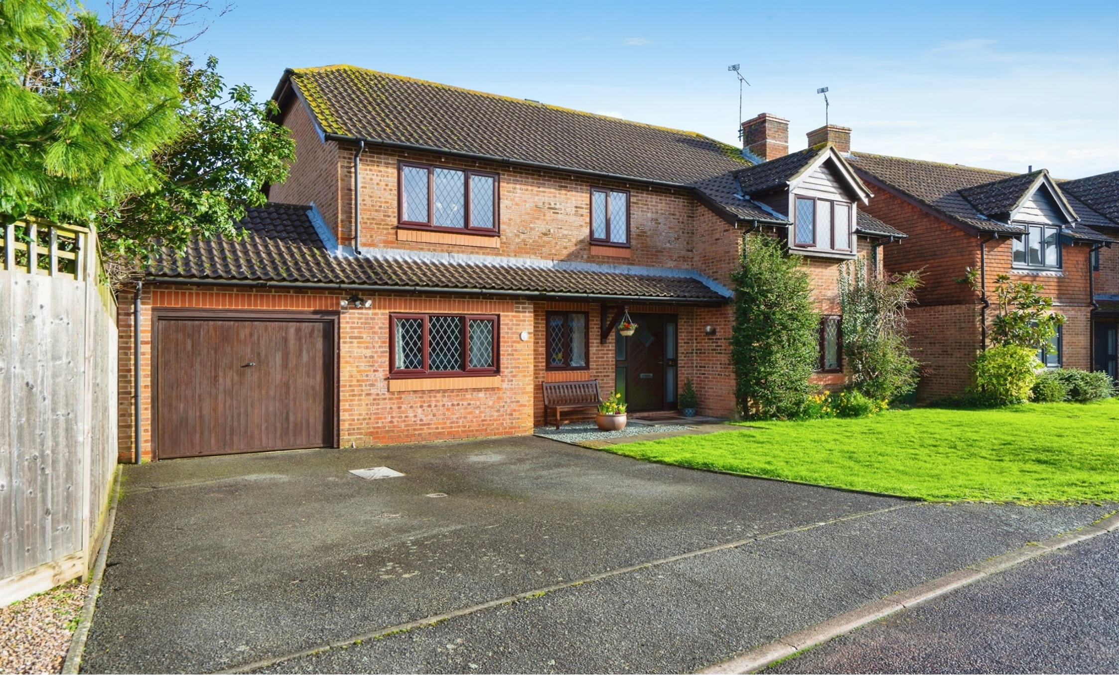
Woodgate Meadow, Plumpton Green, Lewes, BN7 3BD