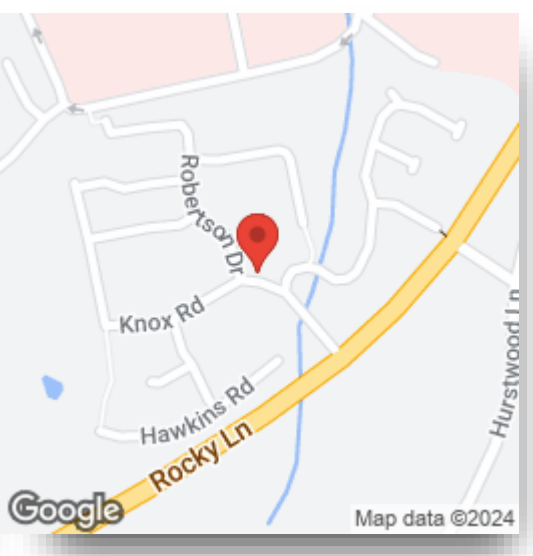
Please note the marker reflects the postcode not the actual property