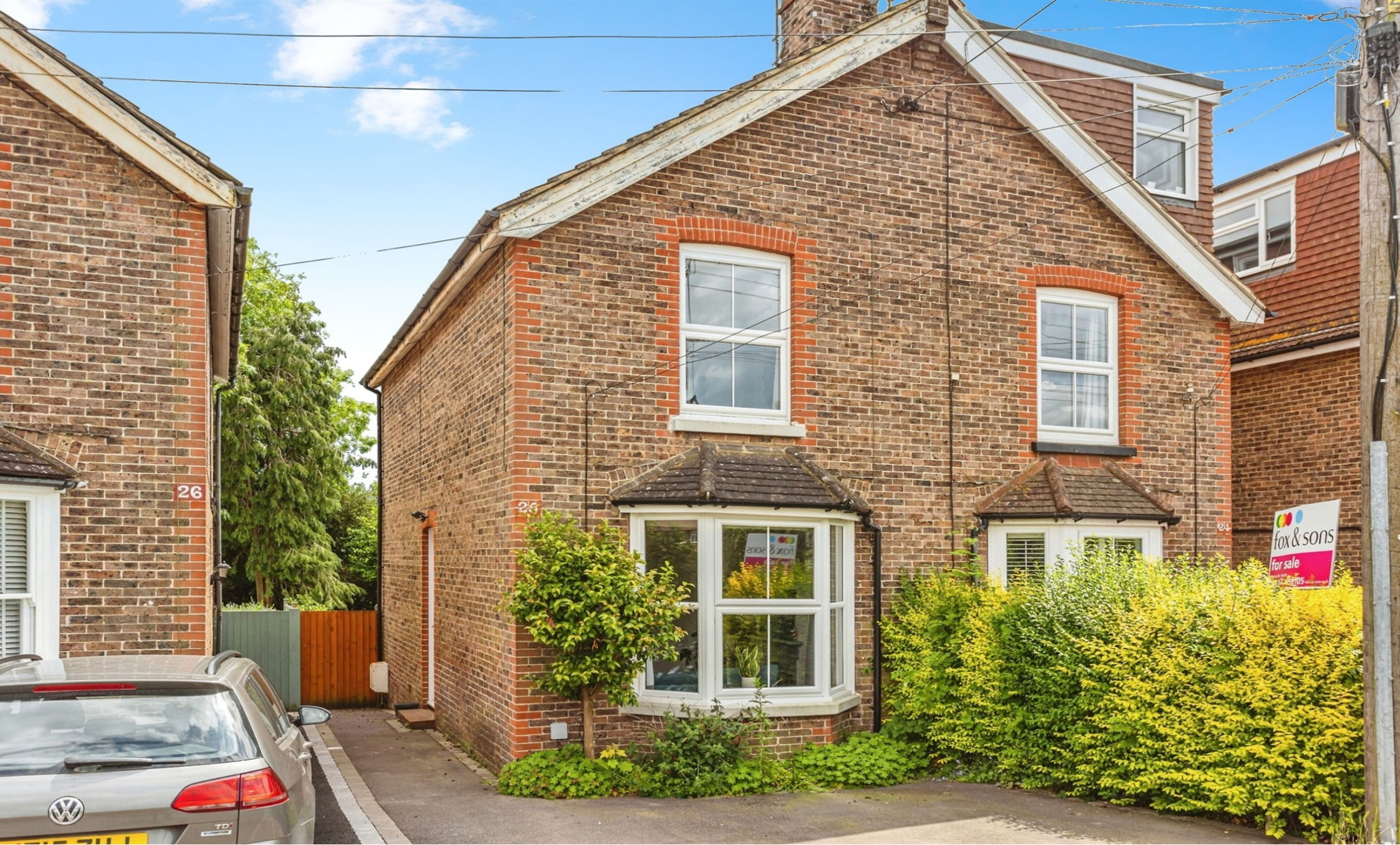
College Road, Haywards Heath, RH16 1QN