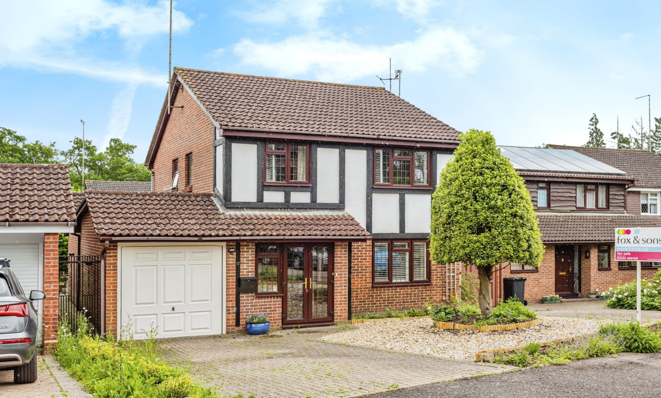
Bridgers Mill, Haywards Heath, RH16 1TF