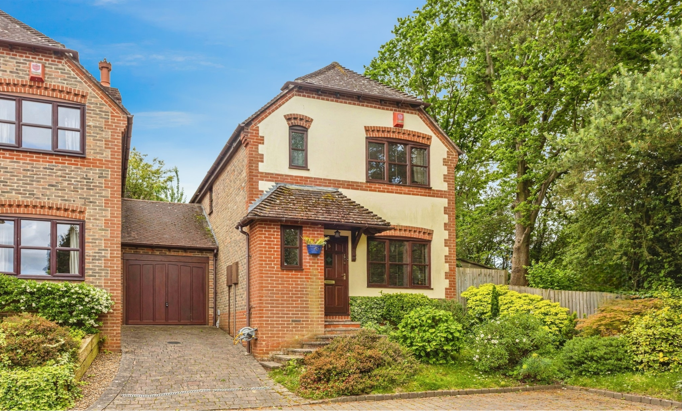
Old Barn Court, Haywards Heath, RH16 4SF