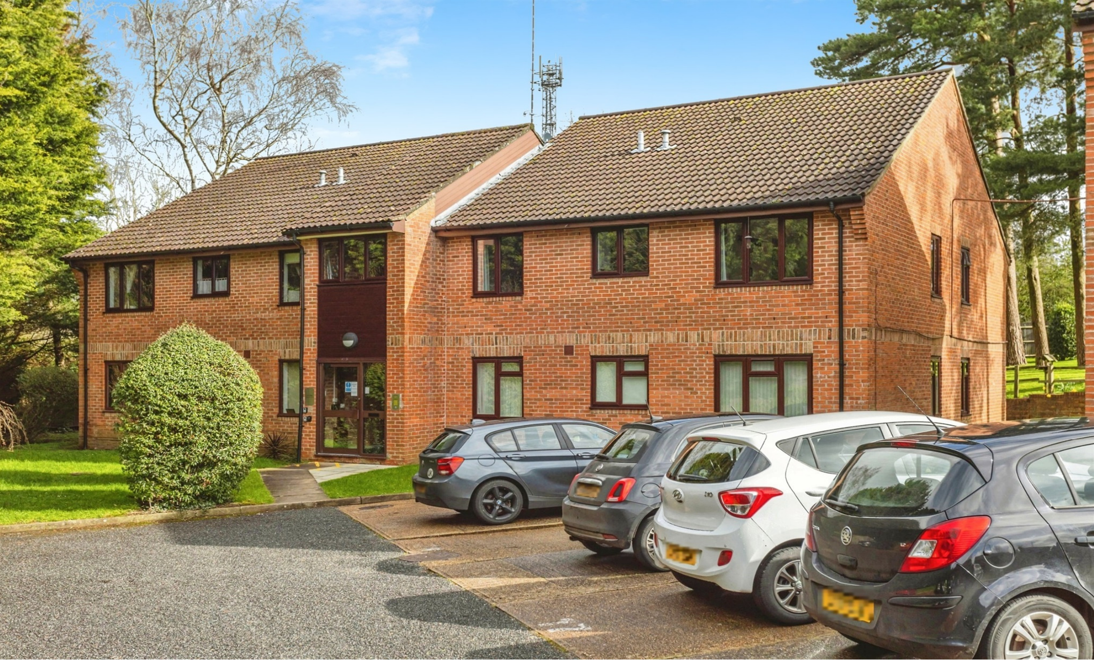
The Forge, Windmill Platt, Handcross, Haywards Heath, RH17 6BS