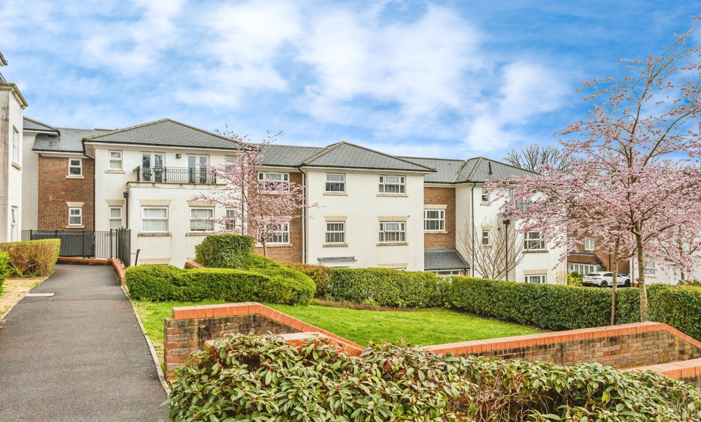
Alderley House, Chandlers Field Drive, Haywards Heath, RH16 4UT