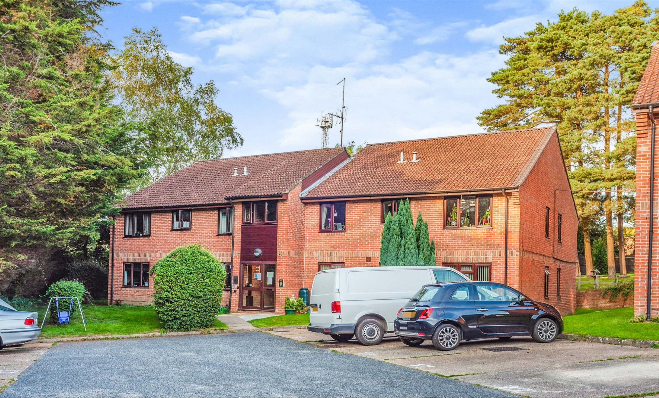
The Forge, Windmill Platt, Handcross, Haywards Heath, RH17 6BS