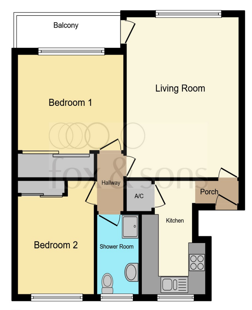
Total floor area 63.4 m<sup>2</sup> (683 sq.ft.) approx

This floorplan is for illustrative purposes only and is not drawn to scale. Measurements, floor-areas, openings and orientations are approximate. They should not be relied upon for any purpose and do not form any part of an agreement. No liability is taken for any error or mis-statement. All parties must rely on their own inspections.