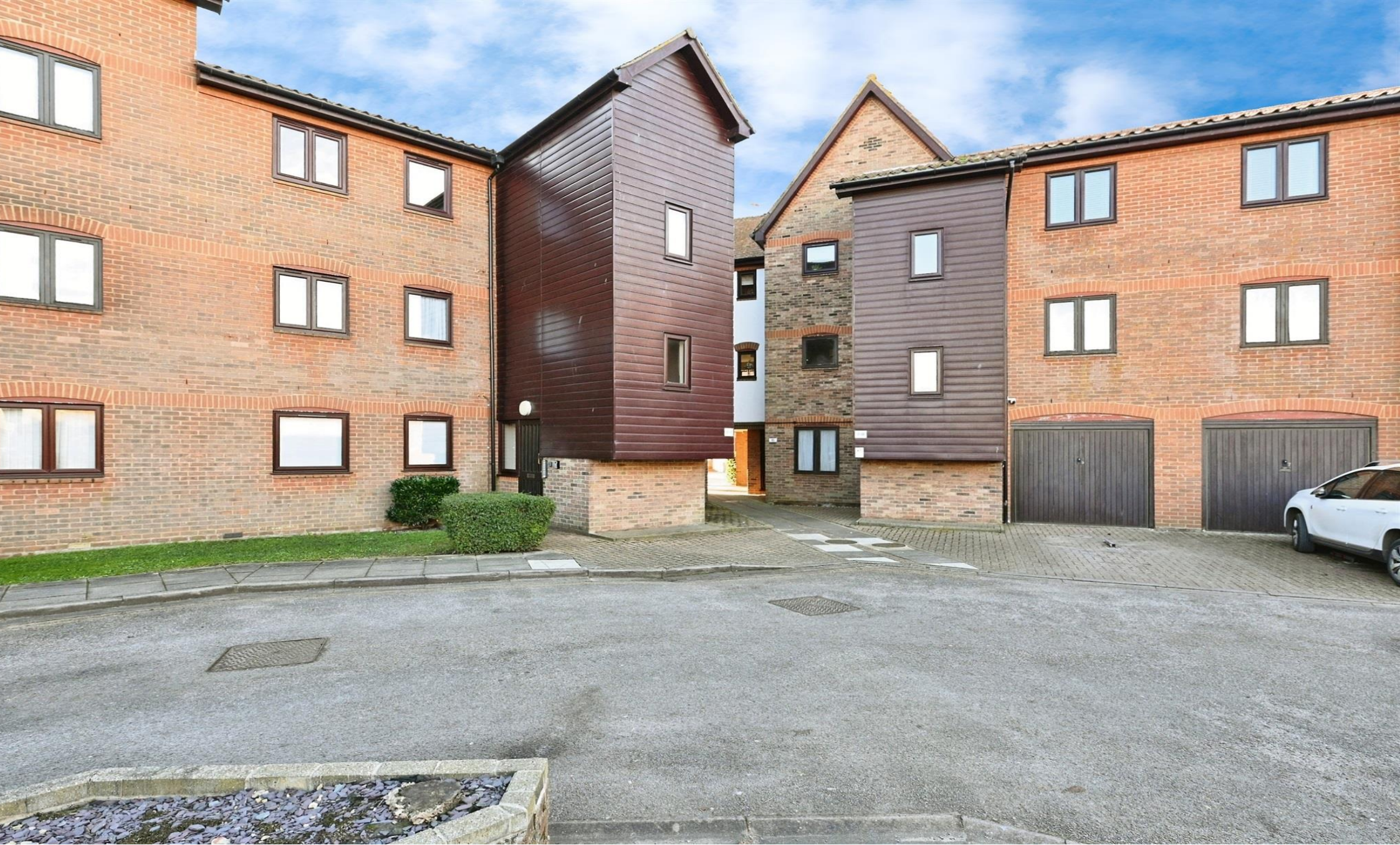
Trinity Quay, Page Stair Lane, KING'S LYNN, PE30 1NQ