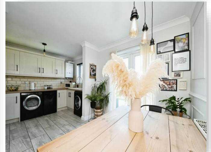
Baldock Drive, King's Lynn, PE30 3DQ