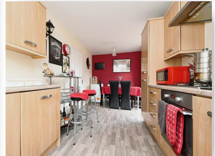
Dairy Way, Gaywood, King's Lynn, PE30 4TR