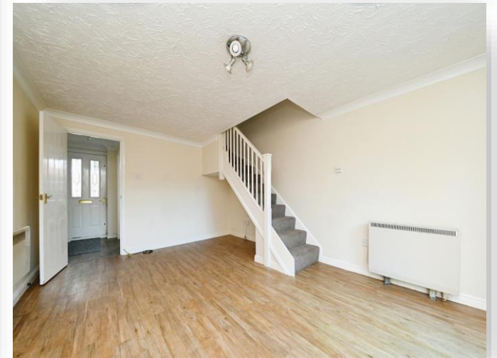
Telford Close, King's Lynn PE30 4UT