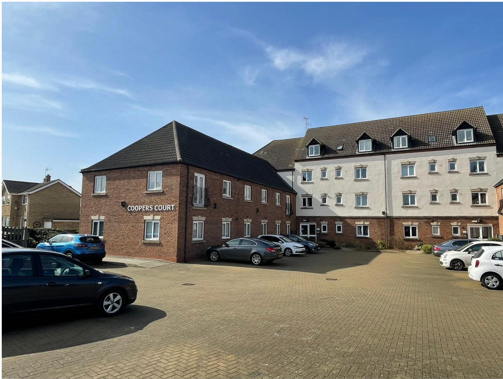
Wisbech Road, King's Lynn PE30 5LJ