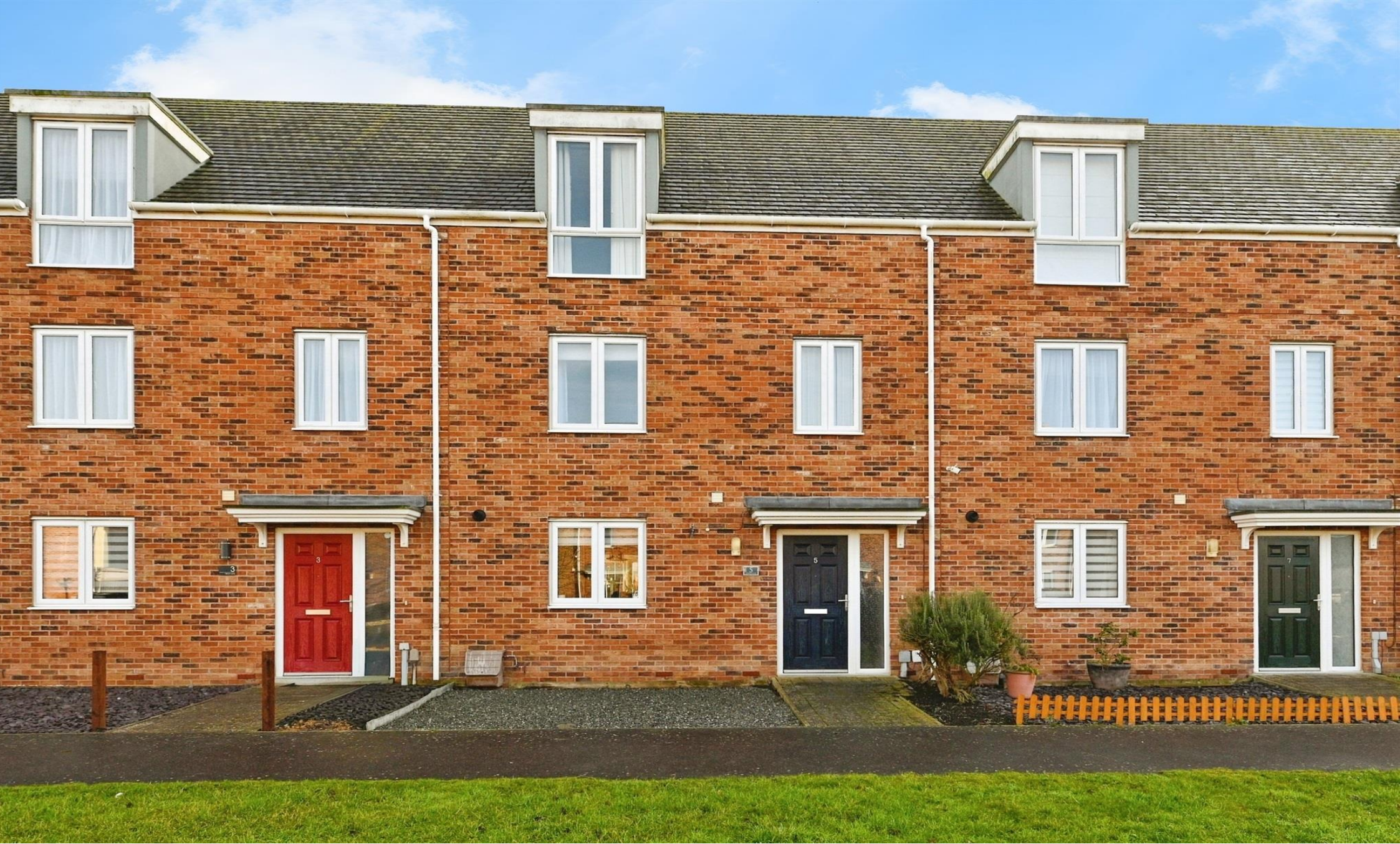
Heron Lane, KING'S LYNN, PE30 5EA