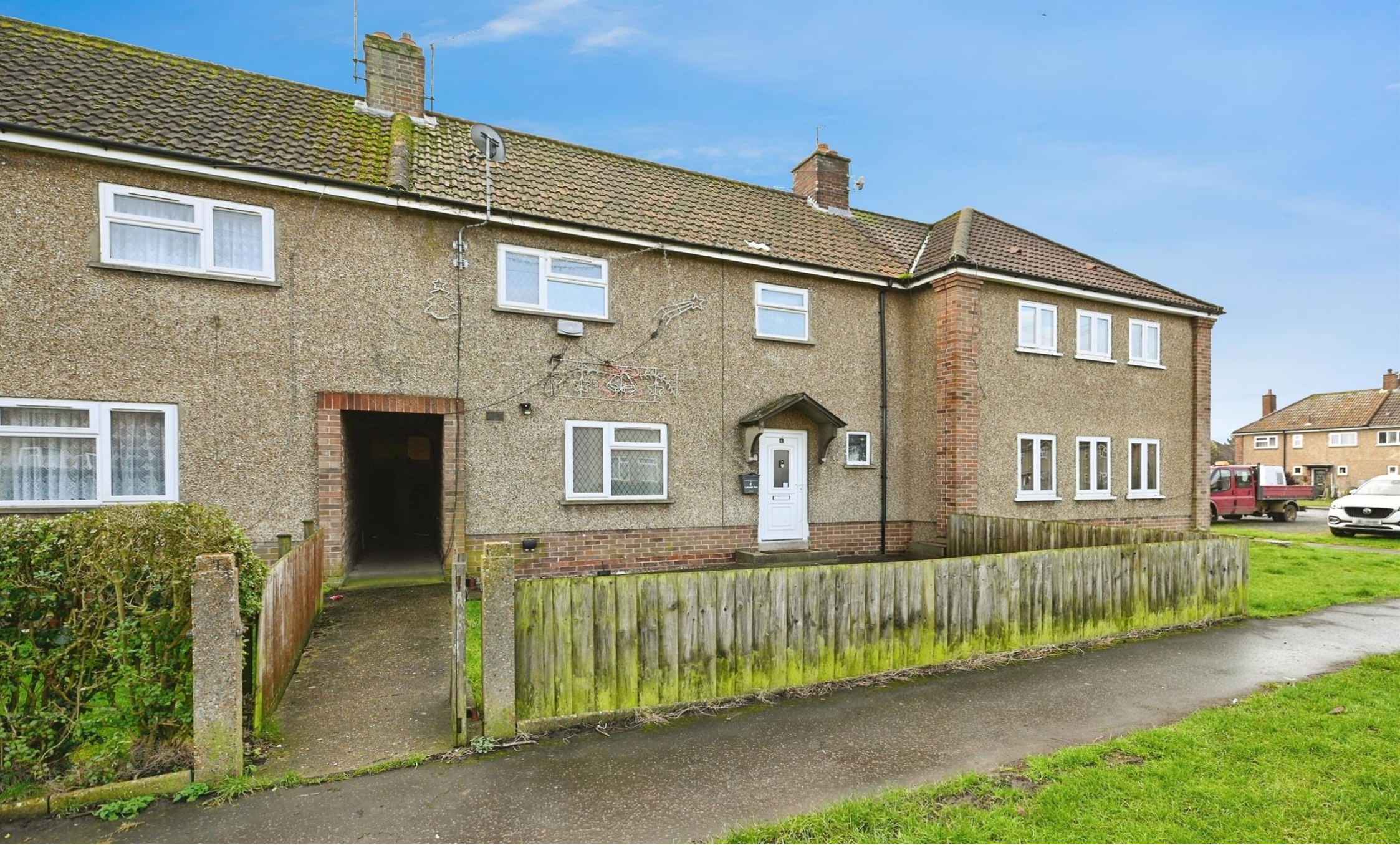
Leicester Avenue, Gaywood, KING'S LYNN, PE30 4PJ