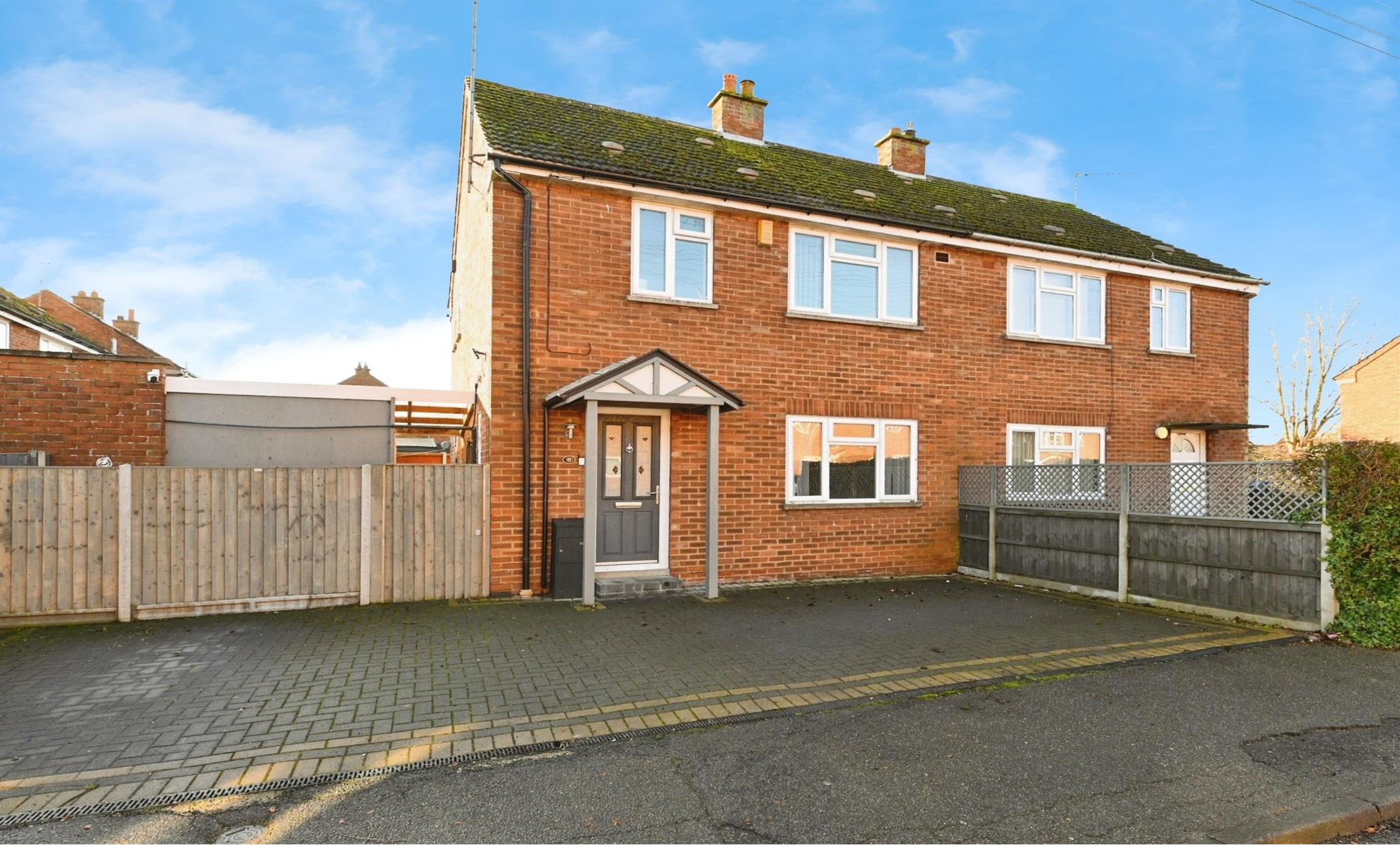
Lady Jane Grey Road, King's Lynn, PE30 2NW