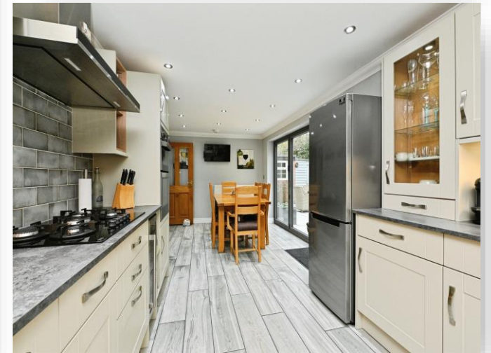
Heather Close, North Wootton, King's Lynn, PE30 3RH