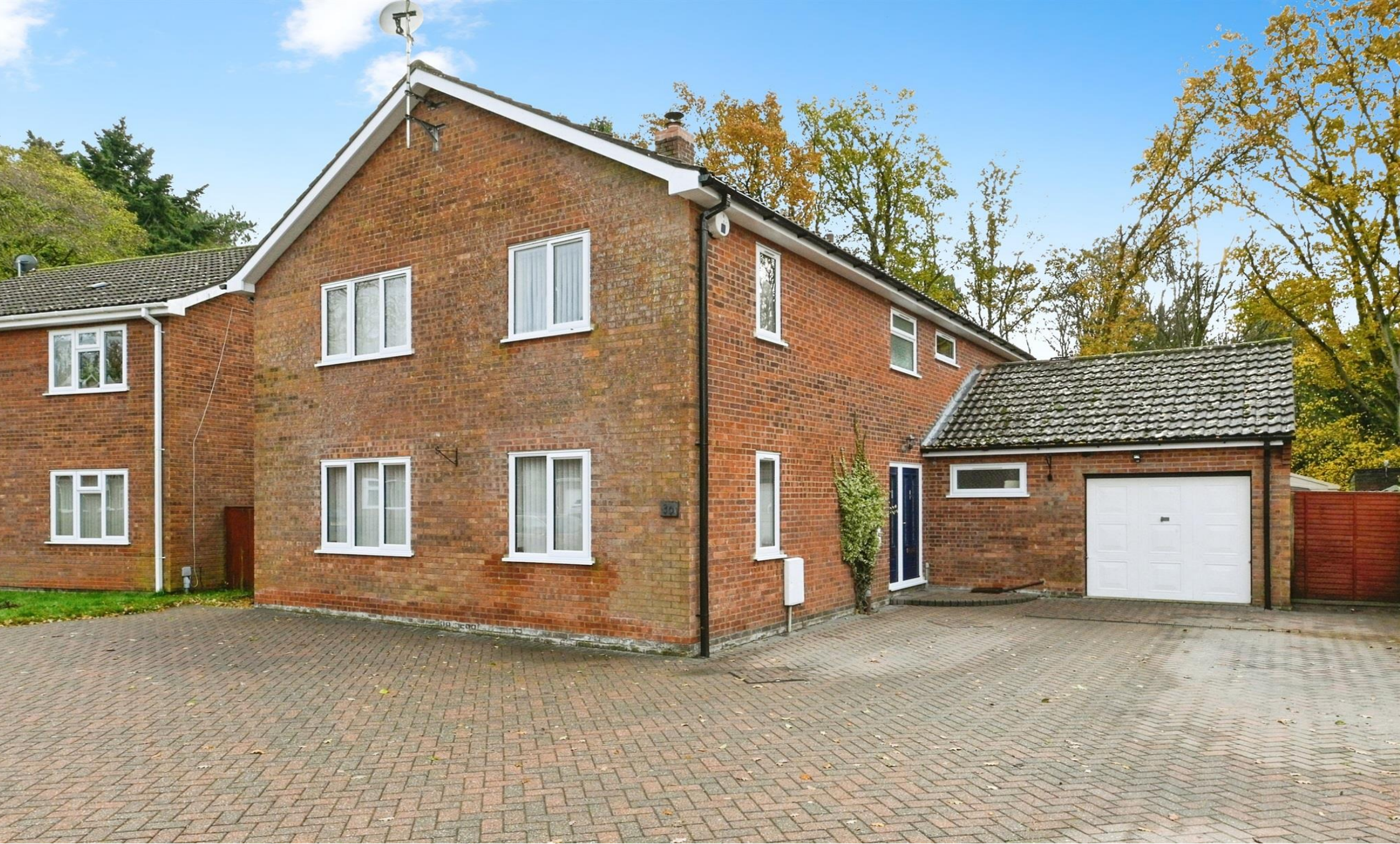
Peckover Way, South Wootton, King's Lynn, PE30 3UE