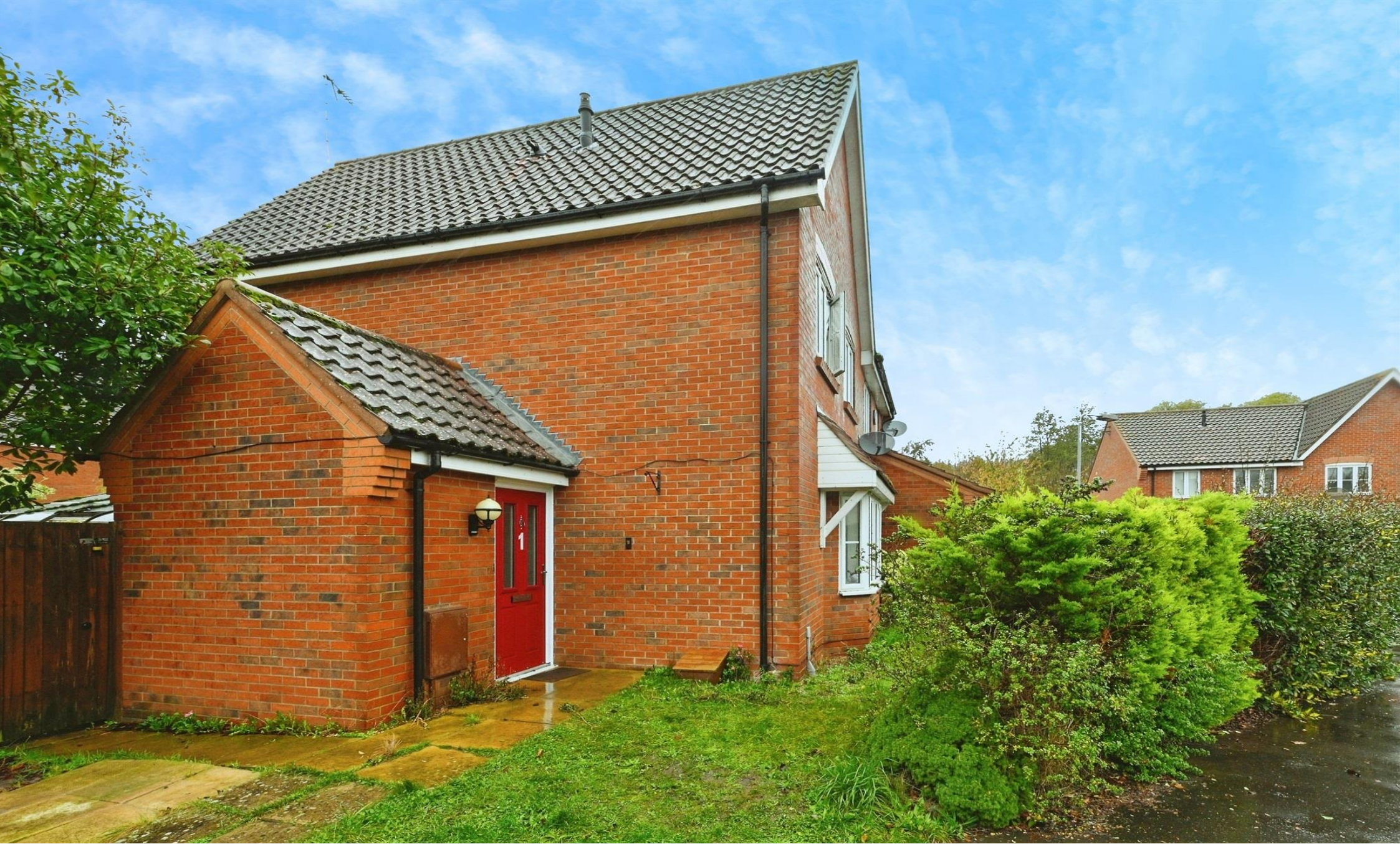
Isabella Close, King's Lynn, PE30 4GL