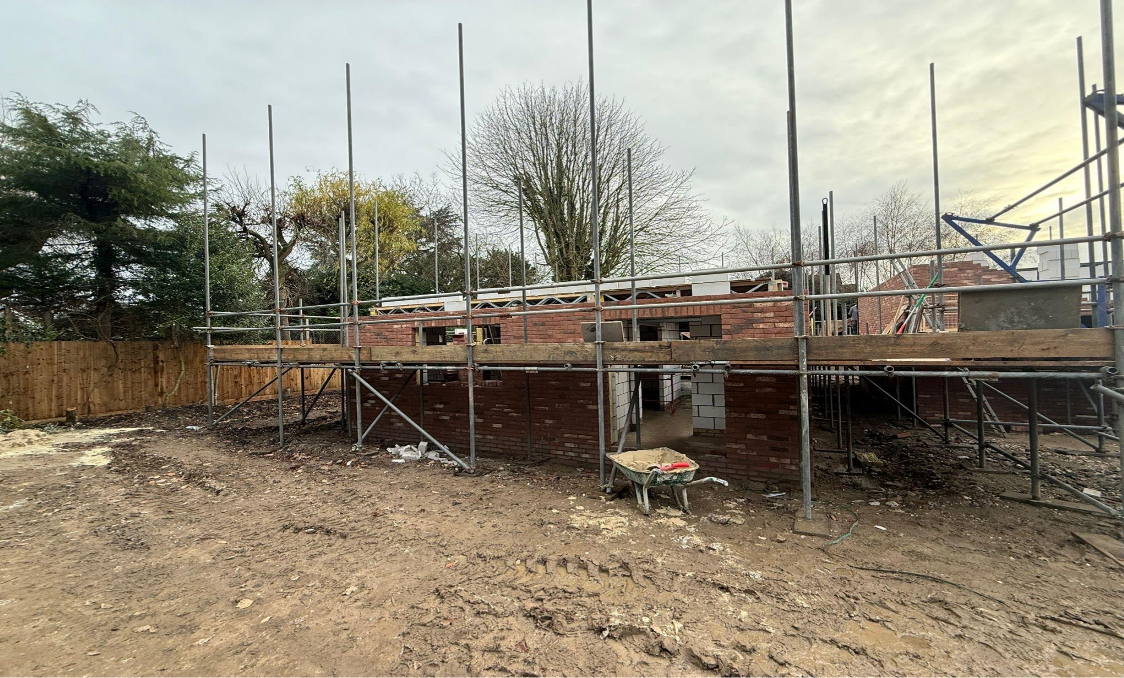
Site East Of 58 Wootton Road, Gaywood, King's Lynn, PE30 4EX