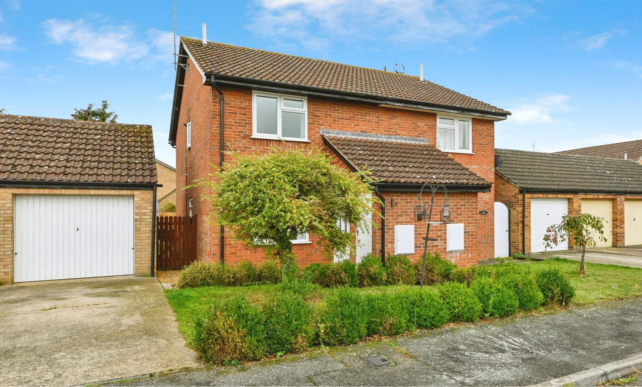
Wesley Road, North Wootton, King's Lynn, PE30 3XB