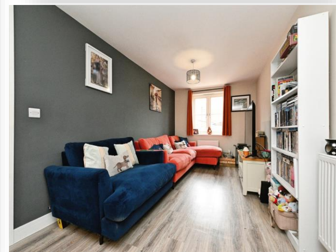
Tower Court, Tower Place, King's Lynn, PE30 5DF