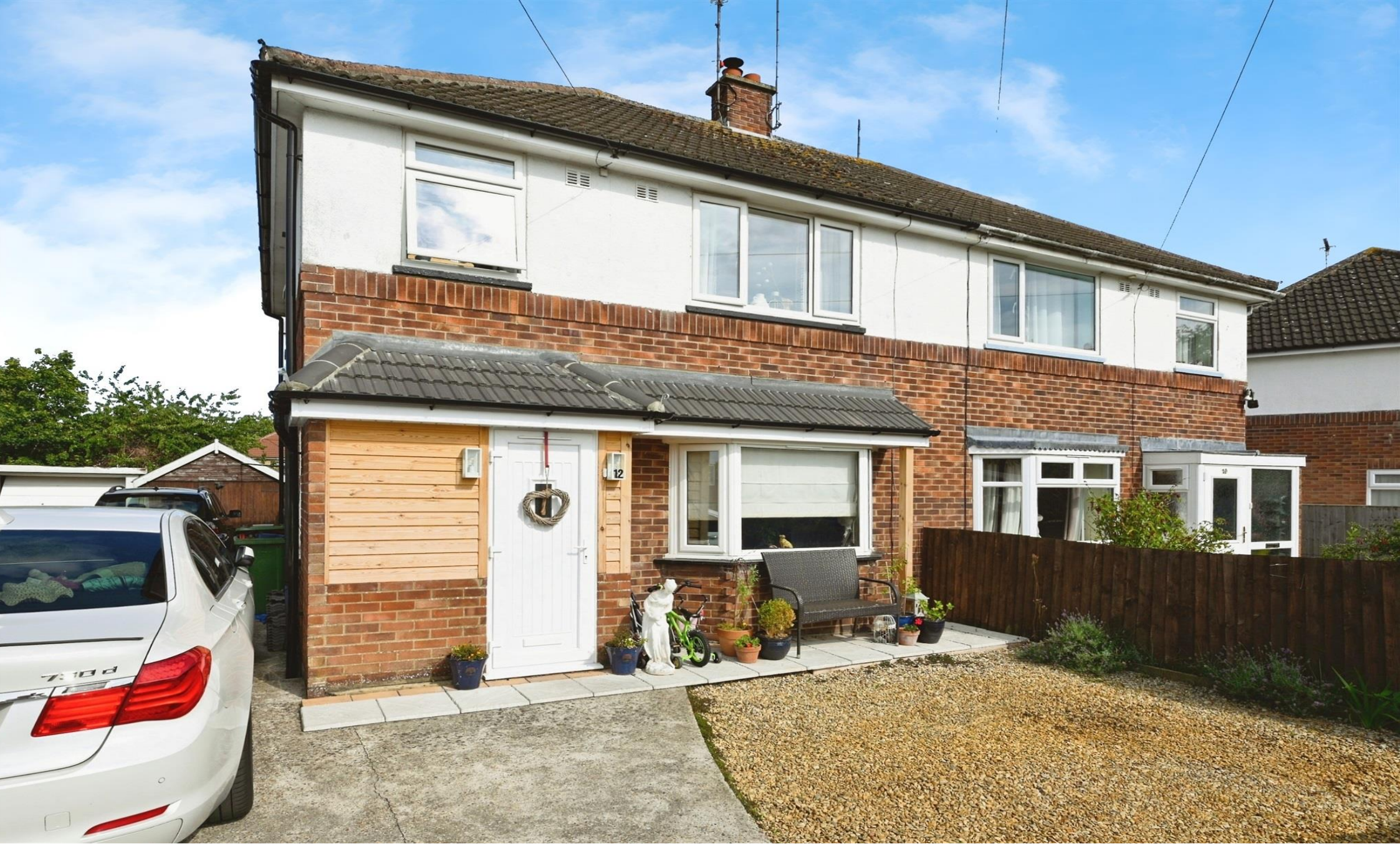
King John Avenue, Gaywood, King's Lynn, PE30 4QA