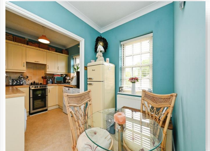
Chapel Court, Chapel Street, King's Lynn, PE30 1EG