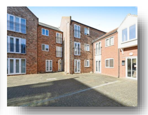
King's Lynn Minster St James St Church St Millfleet All Saints Church, South Lynn