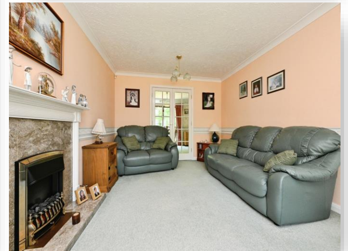
Old Kiln, West Winch, King's Lynn, PE33 0EG