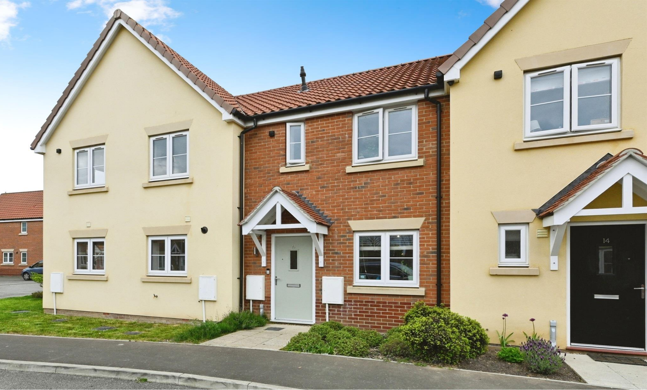
Nightingale Lane, KING'S LYNN, PE30 2FD