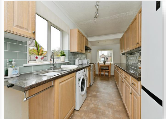
Lansdowne Close, Gayton, King's Lynn, PE32 1QW