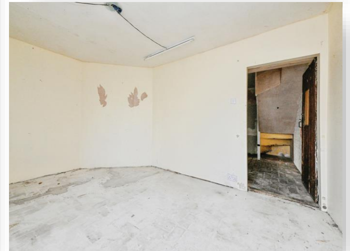
Middle Cottage And Fairfield, Main Road, West Bilney, King's Lynn, PE32 1HP