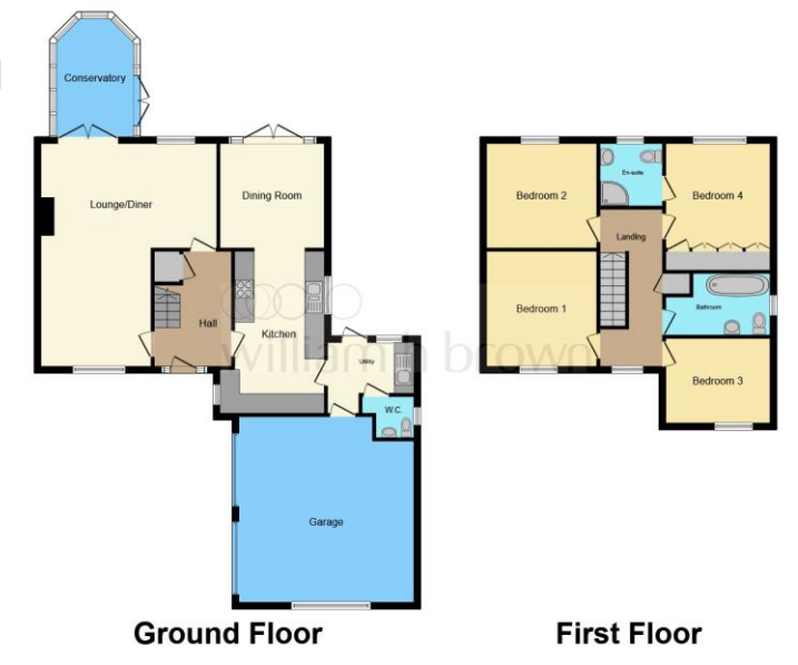
This floor plan is for illustrative purposes only. It is not drawn to scale. Any measurements, floor areas (including any total floor area), openings and orientation are approximate. No details are guaranteed, they cannot be relied upon for any purpose and they do not form part of any agreement. No liability is taken for any error, omission or misstatement. A party must rely upon it is own inspection(s). Nowered by www.focalagent.com