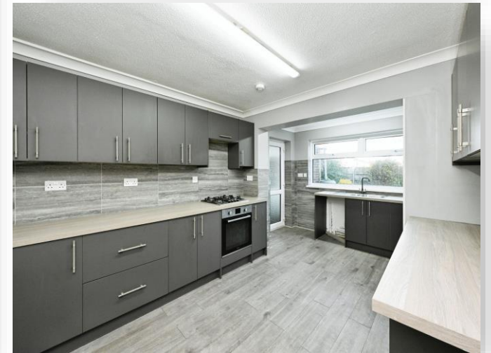
Suffield Way, King's Lynn, PE30 3DL