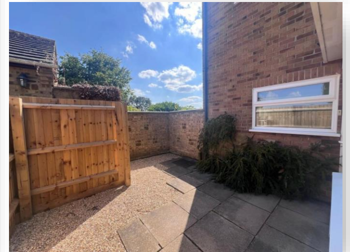
Meadow Cottage, Rectory Lane, West Winch, King's Lynn, PE33 0NR