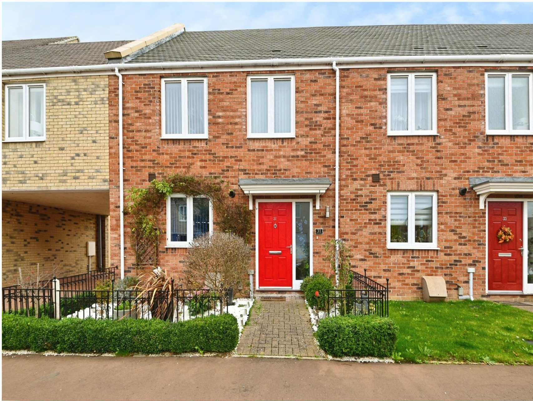
Sandpiper Way, King's Lynn, PE30 5DN