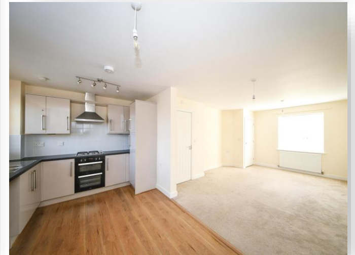
Morston Drift, King's Lynn, PE30 5GA